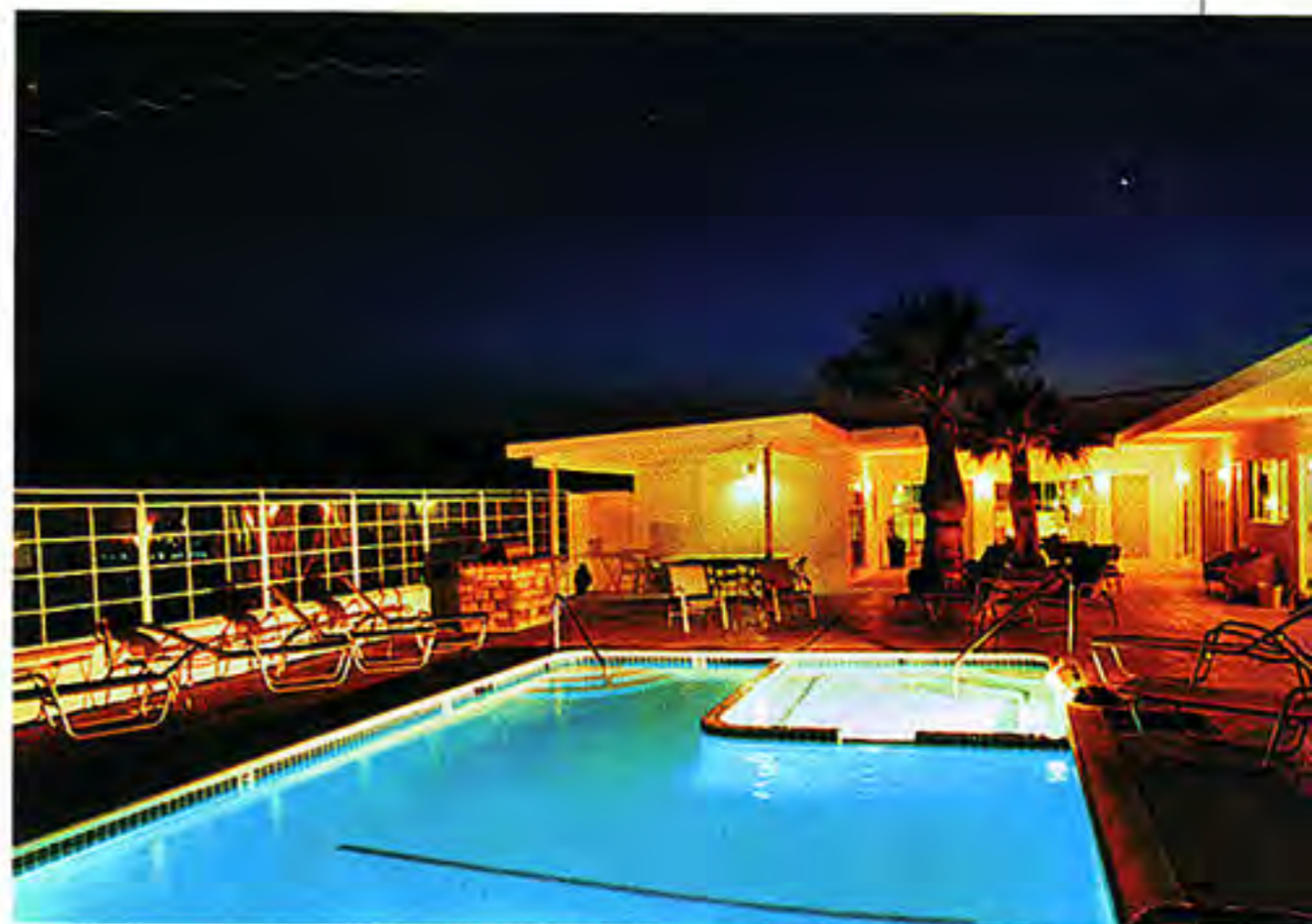
Sagewater Spa in Desert Hot Springs.

With occupancy rates in decline, hotels are dangling carrots—spa and dining credits, gas vouchers, discounts if you add an extra night to your stay—to those who ask for them. Stowe Mountain Lodge (stowemountainlodge.com) in Vermont is tossing in a free massage (normally $85) with each room in November. And in Milford, Pennsylvania, the Hotel Fauchère (hotelfauchere.com) is including dinner for two in its weekend-getaway package, which starts at $650. Specials aren't always promoted on a hotel's Website, so book over the phone and ask specifically about available perks.