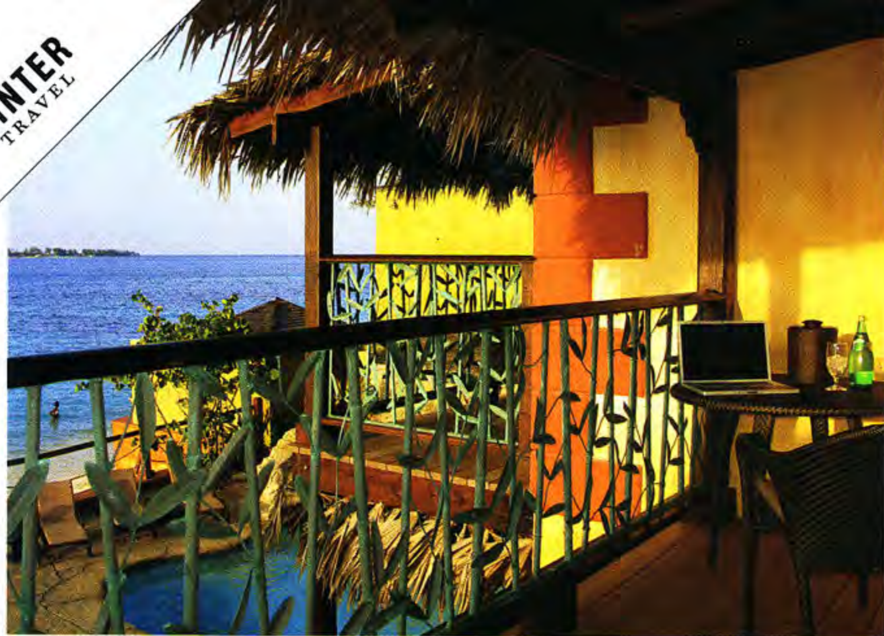
Marley Resort & Spa in Nassau.